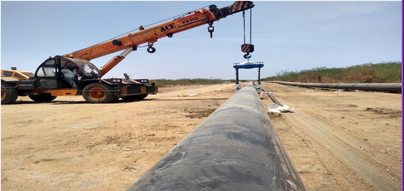
2) PARADIP-HYDERABAD PIPELINE PROJECT - 16" OD(PHPL PROJECT - GROUP A -IOCL)